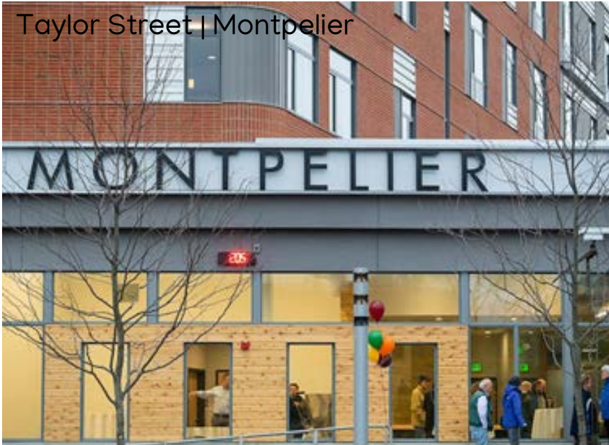
Taylor Street | Montpelier