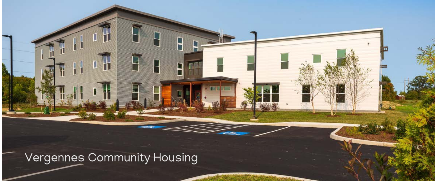
Vergennes Community Housing