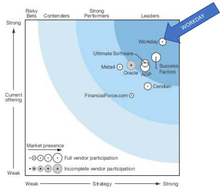
Forrester HR Management Systems