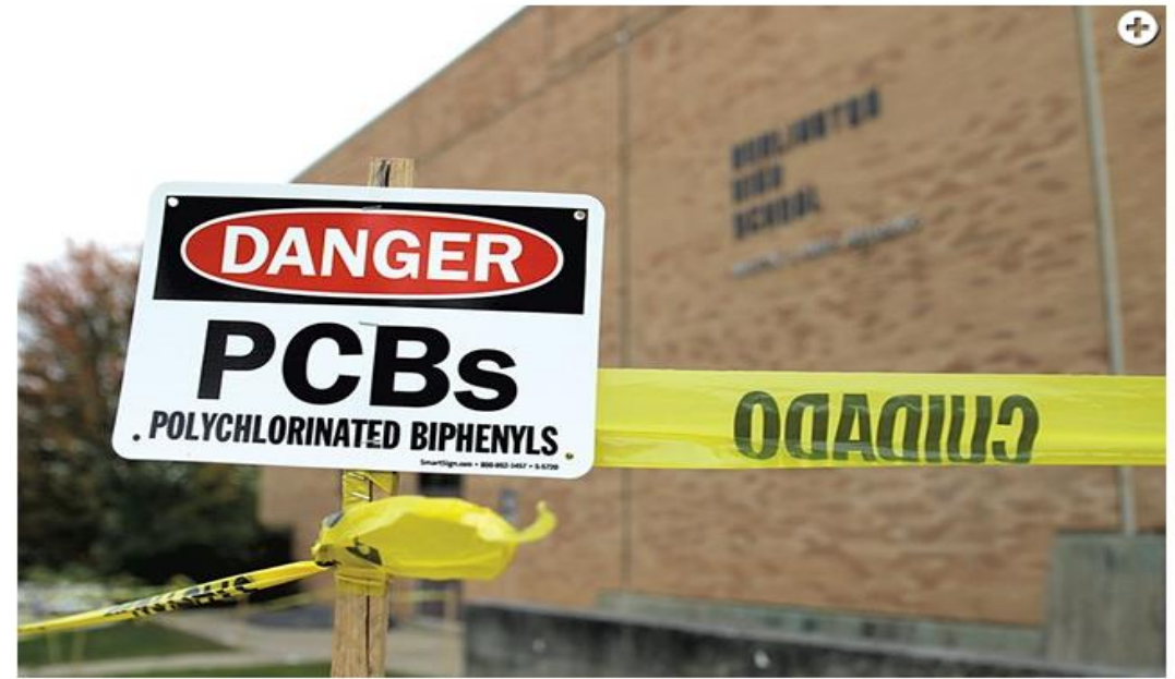
Signs warning about PCBs at Burlington High School