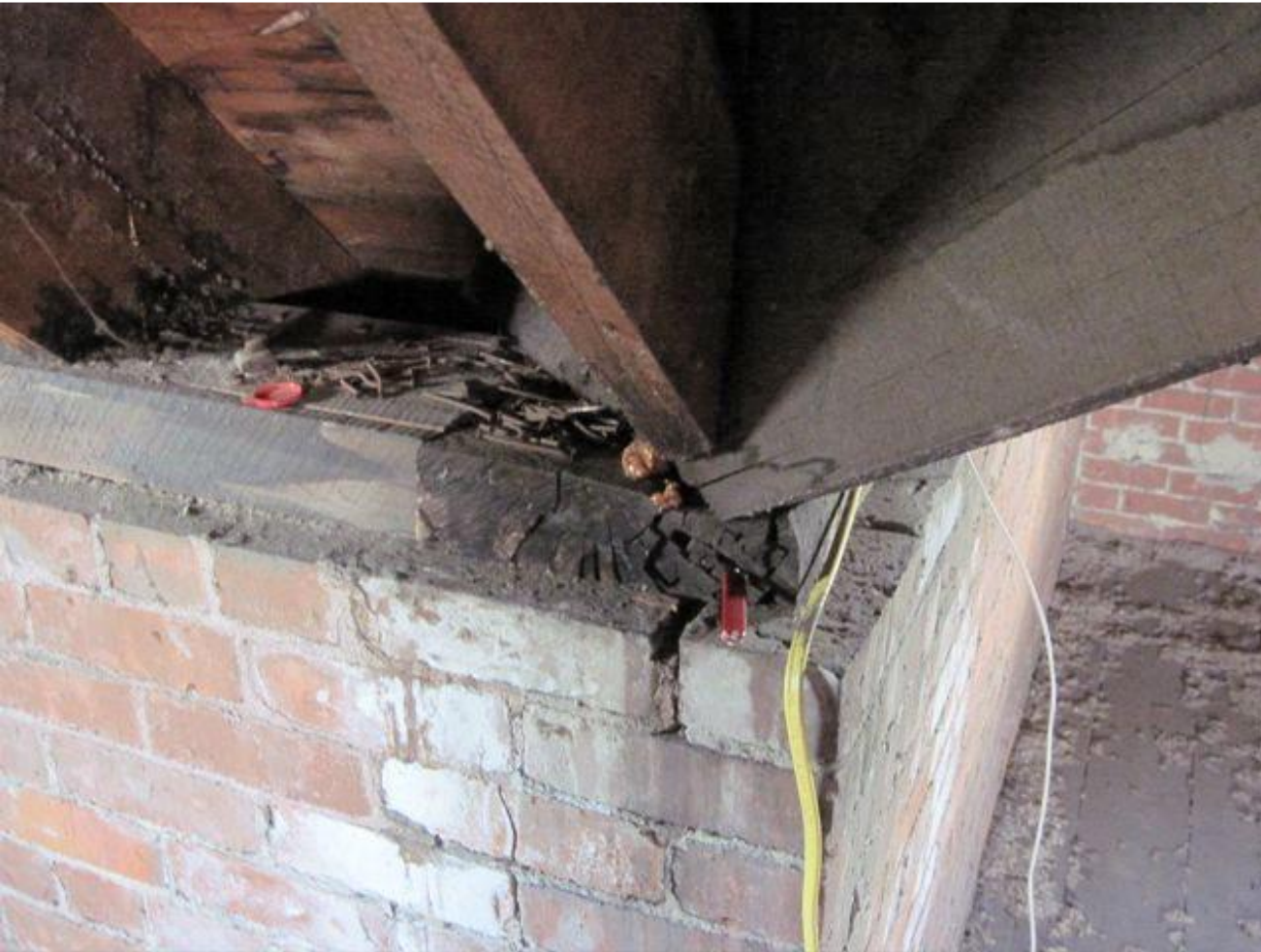
Critical structural rot and pedestal damage supporting the roof at the Weathersfield Proctor Library, Weathersfield, VT