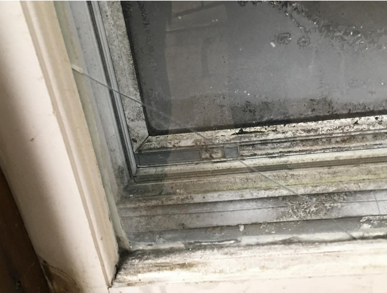
Suspicious looking mold and cracked glass at Arvin A Brown Library, Richford, VT.