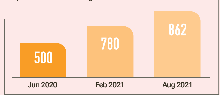
Figure 3 Vacancies in Designated Mental Health Agencies & Specialized Service Agencies<sup>6</sup>

Similar to the challenges that appear to be facing the child care and early education workforce, Vermont's early childhood and family mental health workforce is reporting record high vacancies and turnover rates. As can be seen in Figure 3, there has been a substantial and growing number of vacancies among the Designated Mental Health Agencies (DAs) and Specialized Service Agencies (SSAs) from 500 vacancies in June 2020 to 862 in August of 2021. This sector of the workforce makes possible the critical mental health resources, services, and supports for Vermont's young children and their families. In addition to vacancies, there is a high rate of turnover. During Fiscal Year 2021, there was a 31% turnover rate across DAs and SSAs, reported as the highest turnover rate experienced by the system. While there has been fluctuations in the turnover rate between 19% and 31% over the last 10 years, the increased need and acuity paired with the turnover and vacancy rates are of particular note.<sup>6</sup>