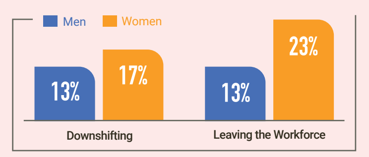
Figure 4 Workers with Children Under 10 Considering Downshifting Their Career or Leaving the Workforce in 2020<sup>8</sup>

As can be seen in Figure 4 , according to the Women in the Workplace 2020 report from McKinsey and Lean In, 1 in 4 women with children under 10 were considering leaving the workforce completely, compared to 1 in 5 men nationally. <sup>8</sup>