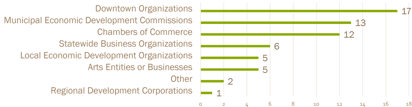
Types of Applicants Receiving Awards