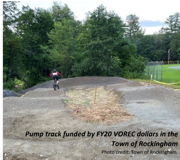
Pump track funded by FY20 VOREC dollars in the Town of Rockingham

The program was designed to serve all different elements of a community – including businesses, senior centers, and other community organizations - with municipalities as the fiscal sponsors for projects. The decision was made with the expansion of the FY22 program to expand applicant eligibility to non-profit organizations who are resources to municipalities. Of the 41 applicants invited to submit full applications in FY 22, fourteen (14) were non-profit organizations.