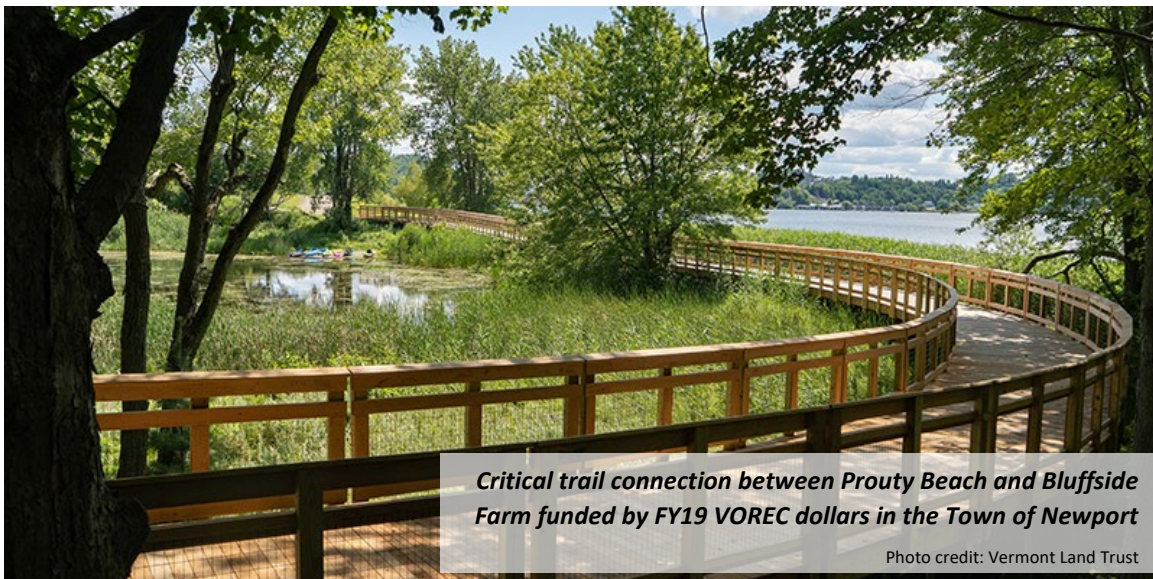
Critical trail connection between Prouty Beach and Bluffside Farm funded by FY19 VOREC dollars in the Town of Newport