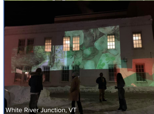
White River Junction, VT