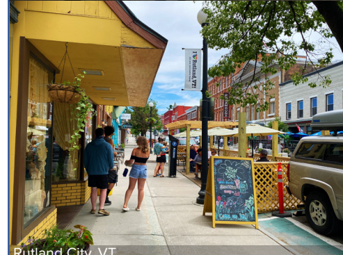
Rutland City, VT