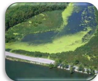
Photo: Algal Bloom