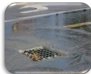
Photo: Road stormwater collection