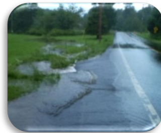
Photo: Stormwater runoff from impervious surfaces