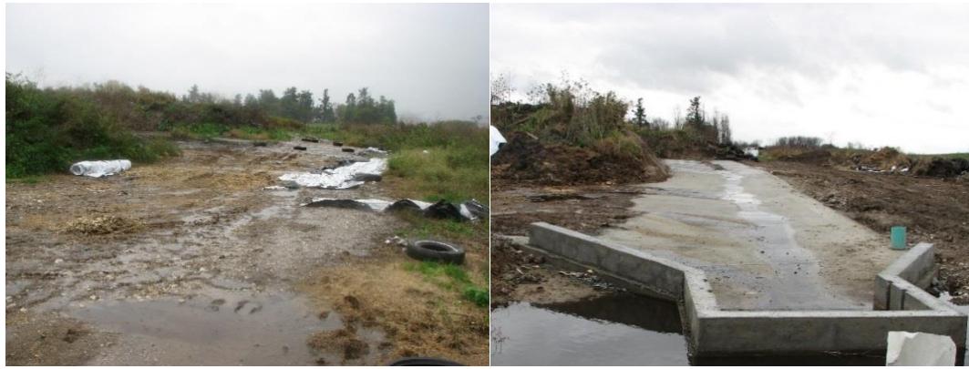
Figure 1. BMP for silage leachate collection system, before and after.