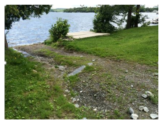
Lakeshore path stabilized with stone to prevent further erosion