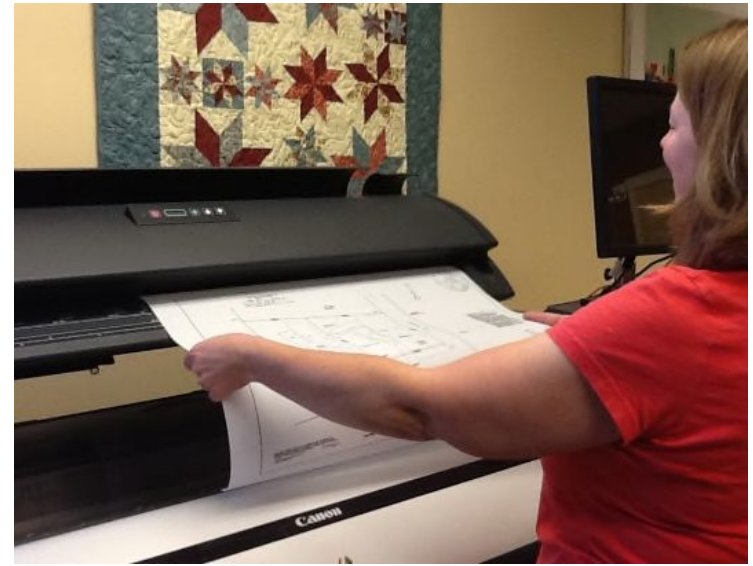
Scanning Mylar into Digital System – Colchester