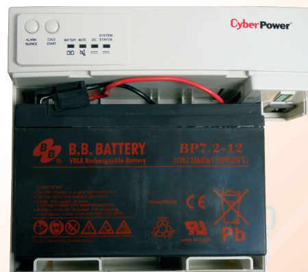
With cover removed to reveal the battery

The battery can provide about 8 hours of service under normal continued use, which is the time the battery remains connected to your ONT, not the time you spend using your phone, Internet, or television. Please note that aged batteries may need replacement. Environmental factors, such as temperature, can shorten your battery's useful life. Batteries will not last forever and should be replaced periodically according to the manufacturer's recommendation. It is the customer's responsibility alone to maintain the battery and purchase replacements as needed. The battery that we install with your fiber connection is a VRLA Rechargeable BP7.2, 12-Volt unit.