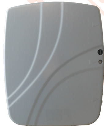
Optical Network Terminal (ONT)

First, the traditional square phone box known as a NID (Network Interface Device) which was the termination for the traditional copper network, has been replaced by a larger new housing which contains your ONT (Optical Network Terminal). This one unit provides each customer with dial-tone, as well as Internet and television if the customer chooses.