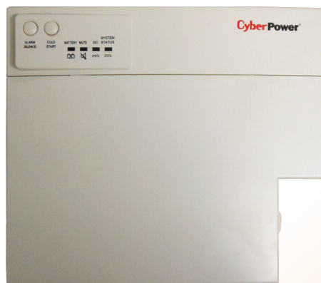
Power supply casing

Second, each customer location requires a power supply to the ONT. This unit serves two functions: it provides a regulated power supply to the ONT, and also provides back-up power to the ONT in case there is a loss of commercial power. This is a major difference from the traditional copper network which received its power from a Central Office or remote terminal. Without a back-up battery or alternative back-up electrical source, such as a generator, customers will not be able to make any calls, including emergency calls to 911, during a power outage. In order to preserve the life of the battery during a power outage internet and television services are not powered by the back-up battery. The power supply consists of two parts, including the power supply itself and an enclosed battery. (Please note that your particular power supply may appear slightly different from the one shown here, but the battery is the same.)