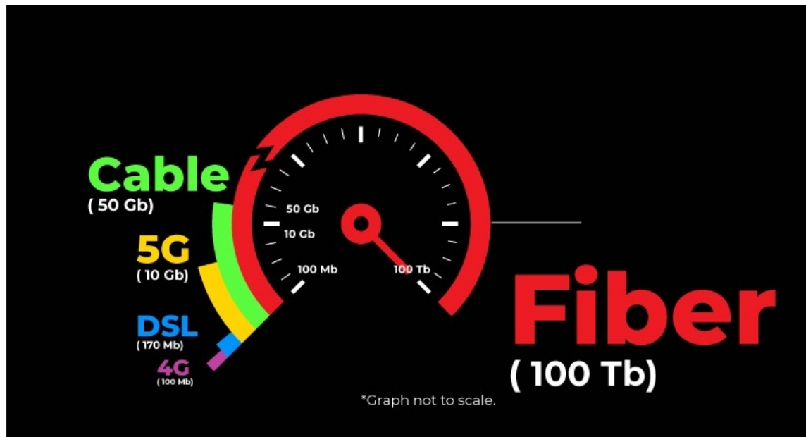
Illustration 2: This shows the relative comparison between technologies. The specifics vary by site. Vermont typically gets lower performance on DSL and wireless than urban areas.

Now let's compare fiber to Starlink (the satellite system being deployed by SpaceX). Starlink maximum data transfer capacity is 20 Gb/sec. Each satellite costs $1 million. One strand of fiber can carry 100 terabyte easily (that number is growing), that is the equivalent of 5000 Starlink satellites (or a $5 billion expenditure). The utilities are hanging 144 fiber counts. That is the equivalent of 720,000 Starlink Satellites. If you were to cover the entire state with fiber it would be less than 1/1000 the asset cost of Starlink and we will have a technology that will be infinitely more flexible. That would assume that Starlink satellites were only dedicated to Vermont. Starlink eventually plans to deploy 12000 for the entire planet