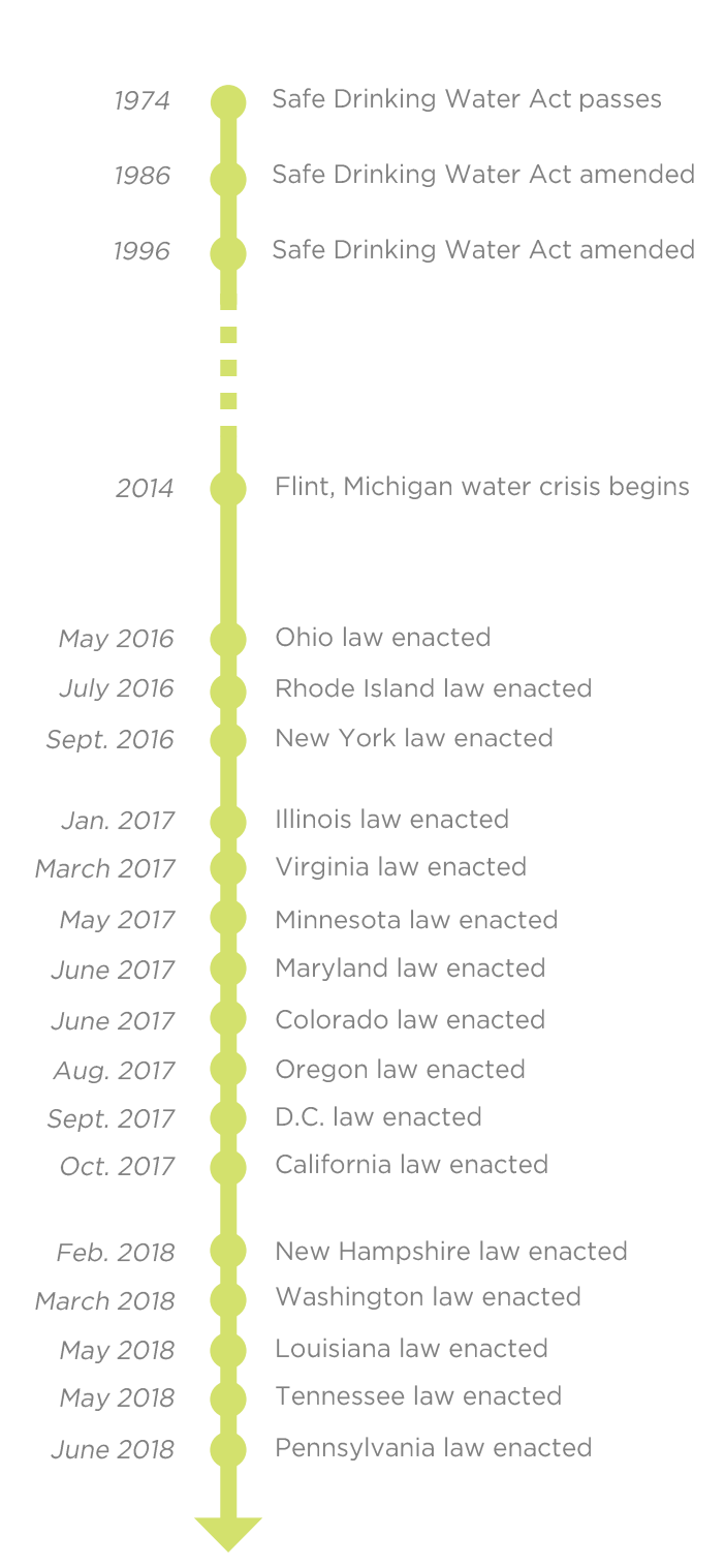
Figure 2. Timeline of State Laws Profiled and Related Key Dates

Appropriates annual funding for two years to pay for voluntary testing of drinking water fixtures in public schools for the presence of lead. Priority is given based on age of children attending, age of buildings, and the date of last test. It also requires the Department of Health to develop guidance and testing protocols that include actions to take if the federal action level is exceeded, recommendations to schools on prioritizing fixture replacement, and recommendations for communicating test results to parents and the community.