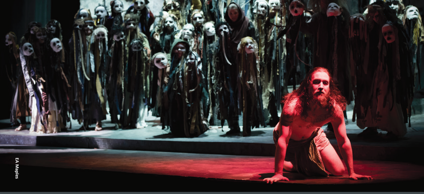
Production of Jesus Christ Superstar at Main Street Arts in Saxtons River.