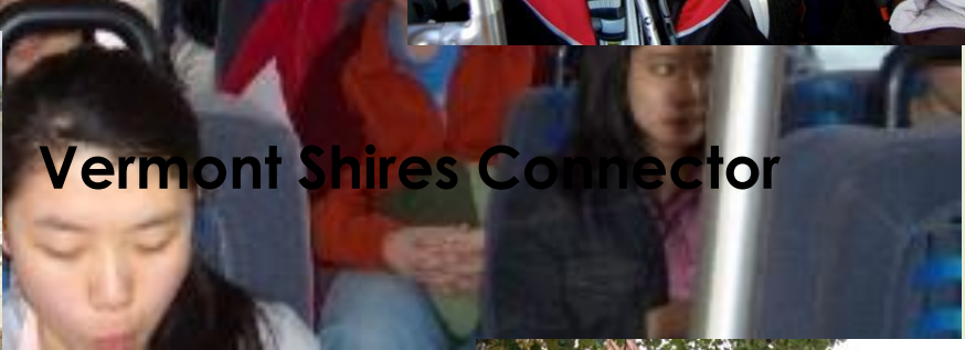
Vermont Shires Connector