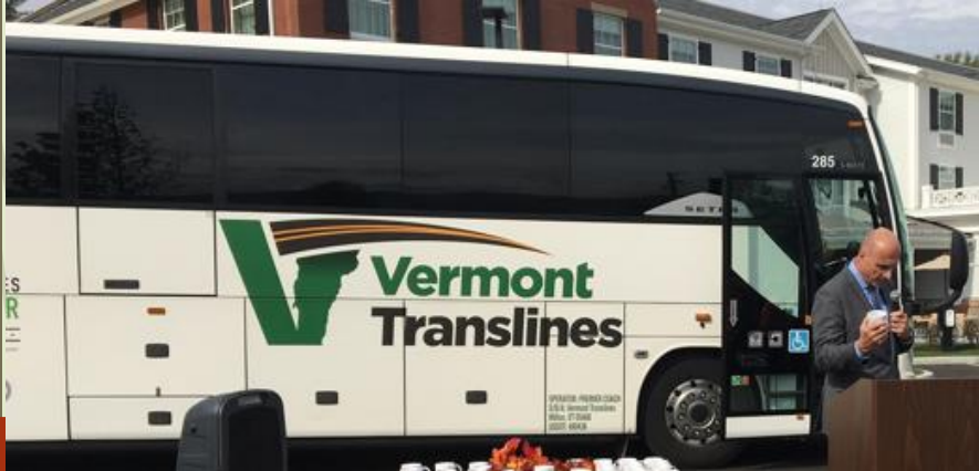
College area bus