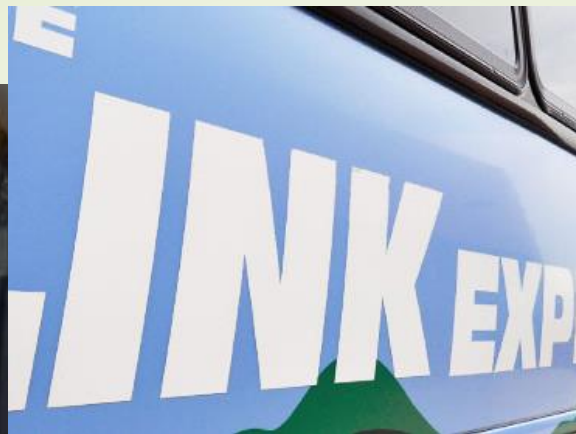
Express Commuter Runs