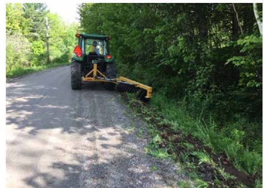
Tractor mounted shoulder disc equipment in use- Town of Johnson, Photo: LCPC