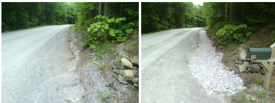
Sample Project: Dorset Hill Road, Dorset, VT, Before and After