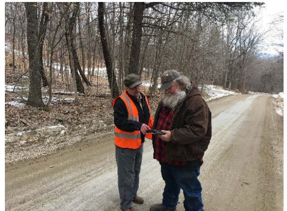
Site visit in Addison County

The project has been successful in part because of its strong partners each serving a unique role in the project. Vermont Department of Environmental Conservation staff provided administrative oversight and technical assistance regarding the best management practices. Regional Planning Commissions worked with each individual municipality to identify the best project sites, plan for best management practices, and verify construction. Northwest Regional Planning Commission served as the fiscal agent and overall program manager. VTrans staff in the Better Roads program and at the District offices provided additional expertise and technical assistance. Municipalities completed construction with municipal staff or through contractors.