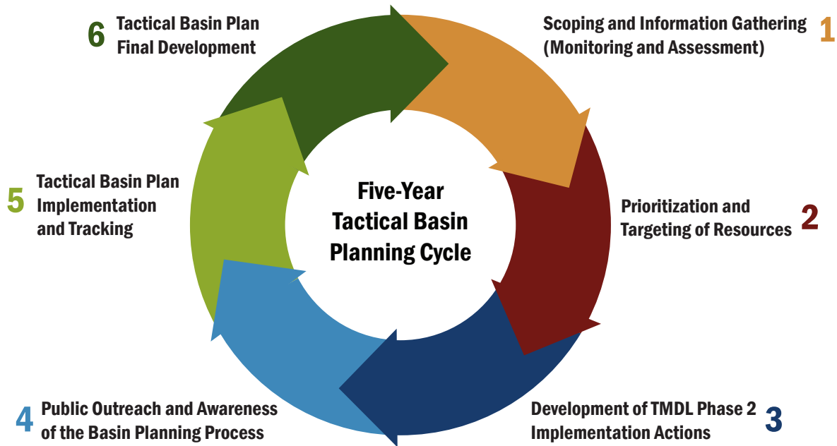
Figure 2. Tactical basin planning follows a five-year cycle beginning with monitoring and assessment to identify and prioritize projects. Then, basin planners work with local partners to implement priority projects. Project implementation and tracking occurs throughout the planning cycle.