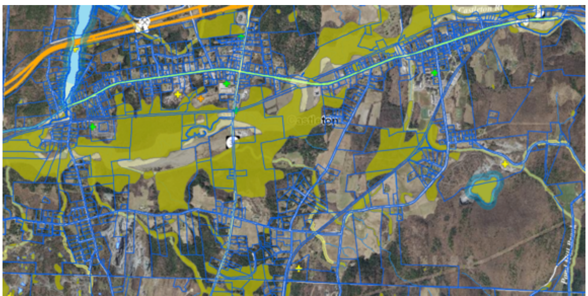
ANR Atlas image – layers turned on showing parcels, wetlands (olive green), streams and river corridors, stormwater permits, quarries