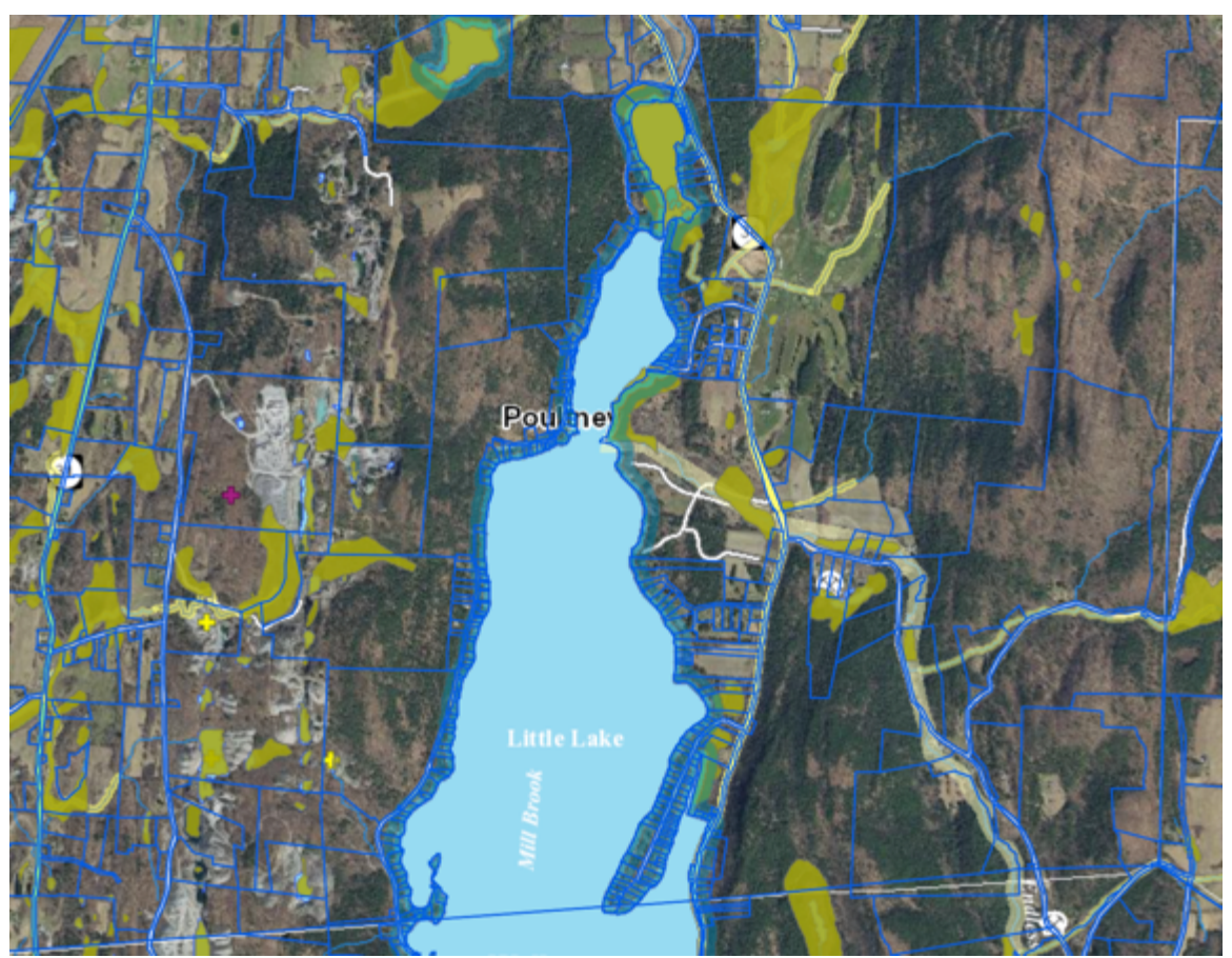
ANR Atlas image – layers turned on showing parcels, wetlands (olive green), streams and river corridors, shoreland, stormwater permits, quarries