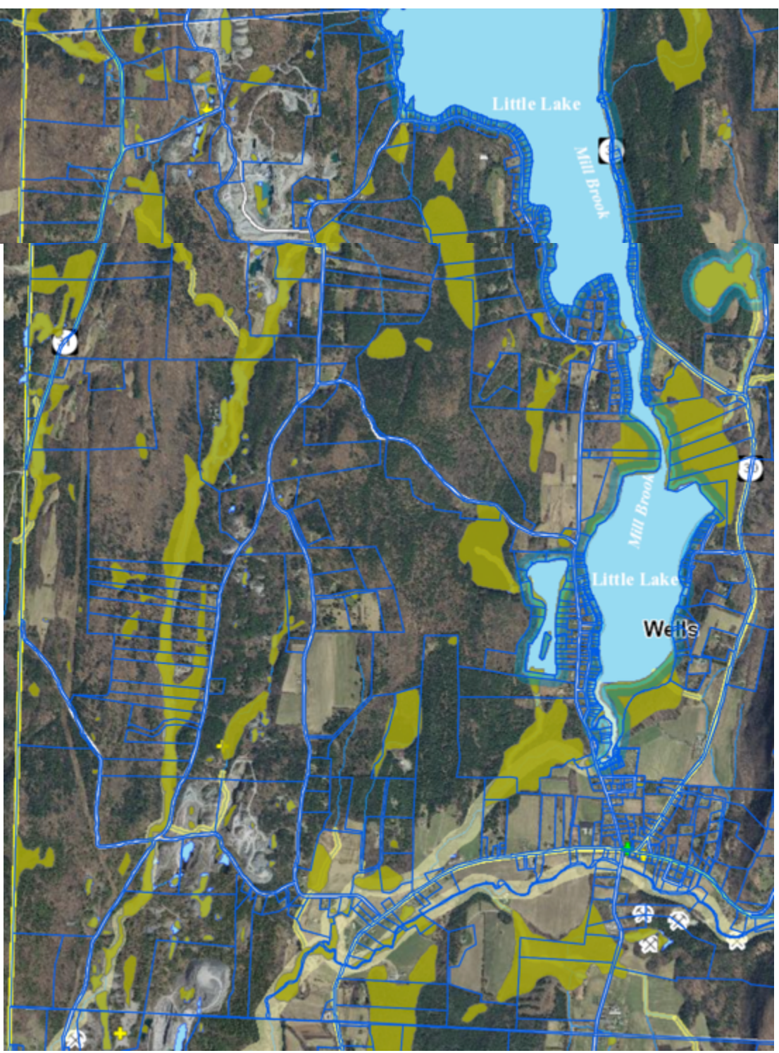
ANR Atlas image – layers turned on showing parcels, wetlands (olive green), streams and river corridors, shoreland, stormwater permits, quarries

Town of Wells Website – No Zoning https://wellsvt.com