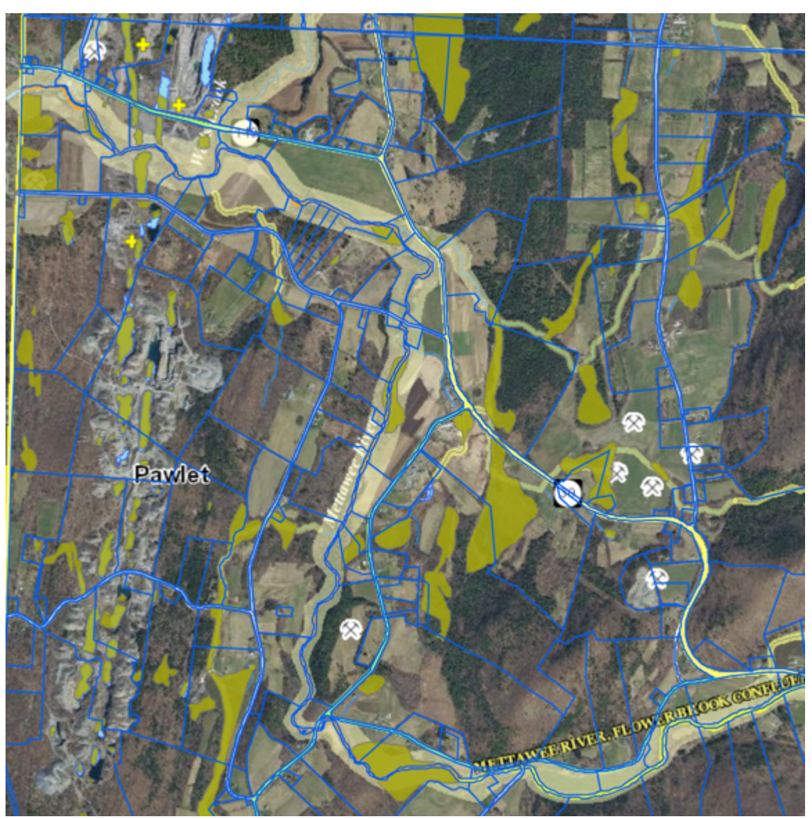
ANR Atlas image – layers turned on showing parcels, wetlands (olive green), streams and river corridors, stormwater permits, quarries