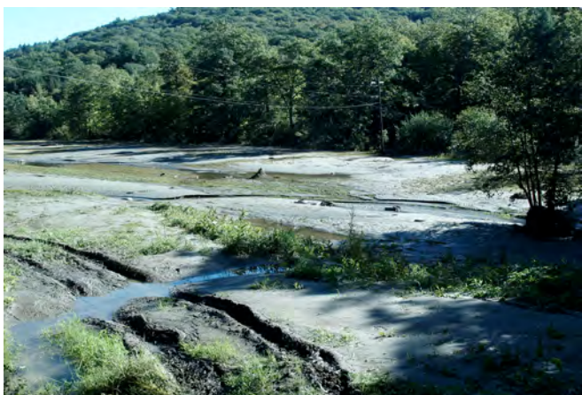
[3] Inundation from Tropical Storm Irene -- August 30, 2011