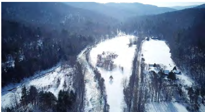
[4] Geomorphic study designates property as priority project for floodplain protection -- 2014