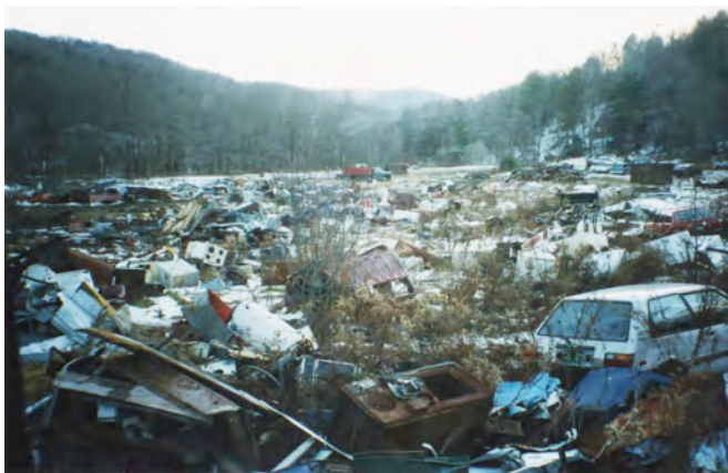
[1] Junkyard -- December 2002