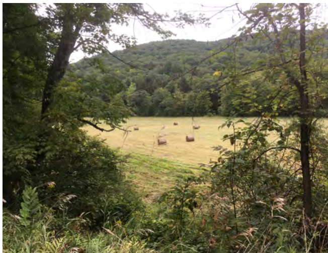
[6] First haying after Brownfield testing -- August 2018