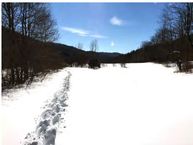
[5] Recreational opportunities include hiking, river access for swimming and fishing, picnics, community gatherings -- 2017