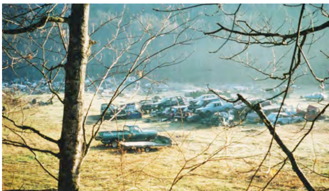
[2] Junkyard Cleanup -- April 2003