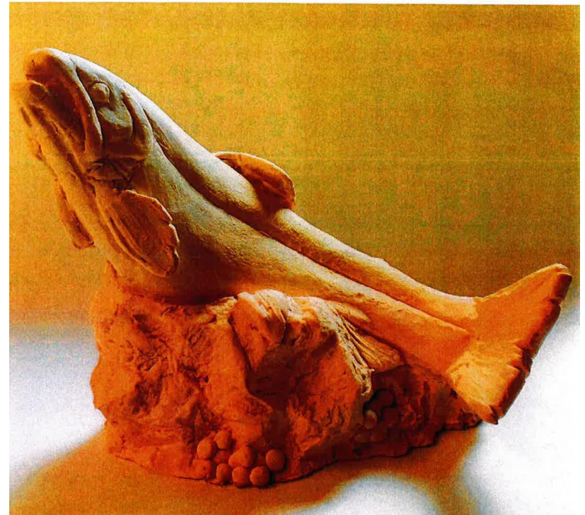
Clay model of sculpture to be carved in green granite

Estimated installation in the fall of 2019