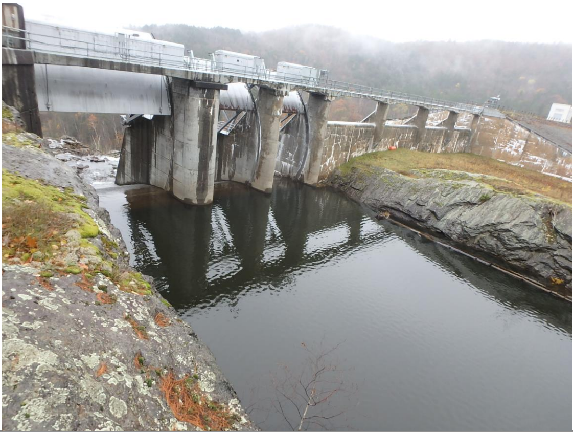
Waterbury Dam Spillway Replacement, Risk Assessment, $215k from previous years. The approach channel in need of a new boat barrier can be seen.