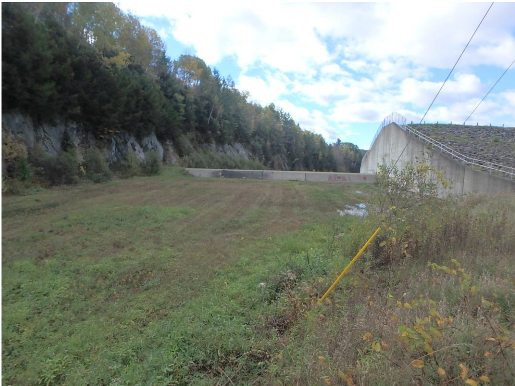
Wrightsville Dam, aux. spillway, note overgrown and aging rock cut at left side of image