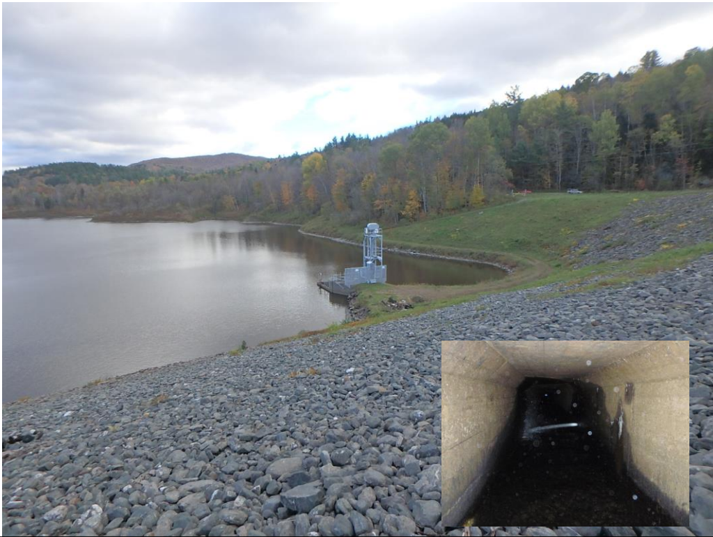
Wrightsville Dam, principal spillway intake structure and leak in spillway tunnel