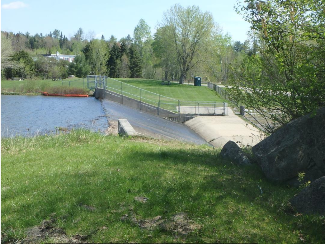
Miles Pond Dam, various minor repairs needed.