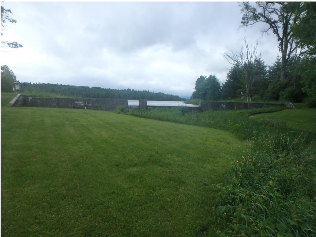
Little Hosmer Dam, assessment, design, rehabilitation construction