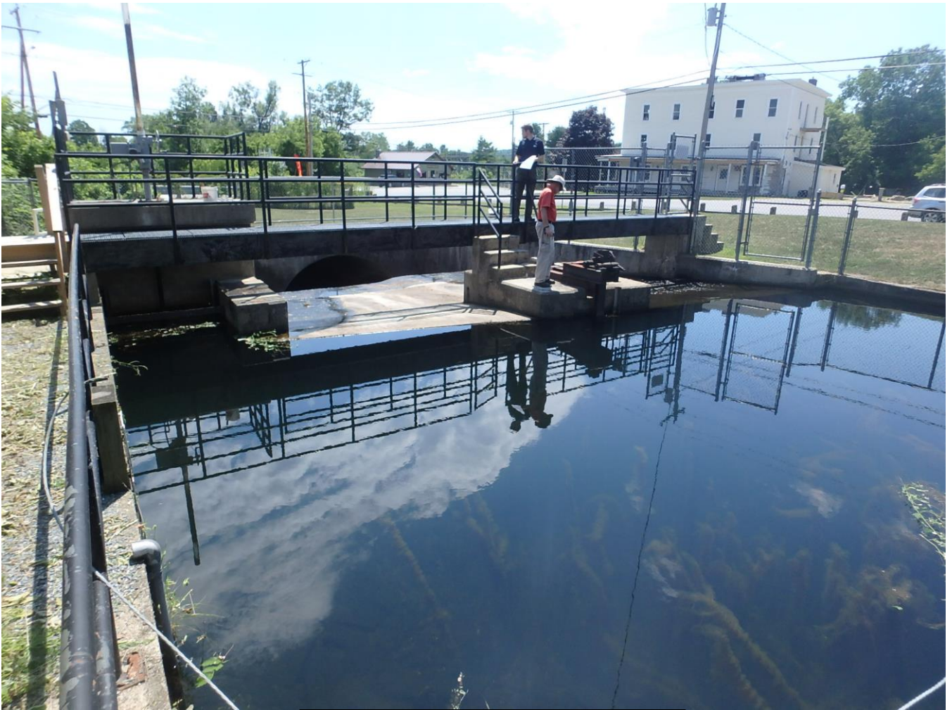
Lake Bomoseen Dam, minor repairs