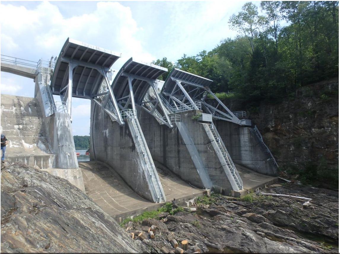
Waterbury Dam Spillway, the access ladders requiring a fall protection system can be seen.