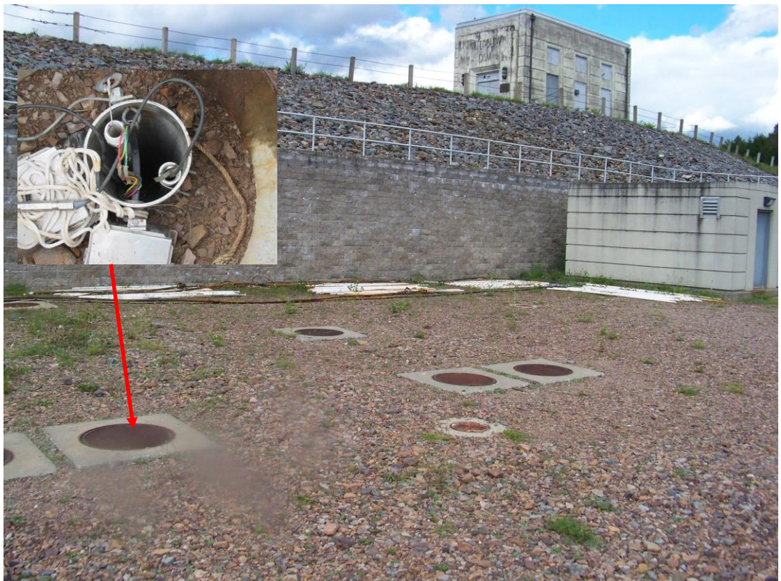
Waterbury Dam Seepage Collection System