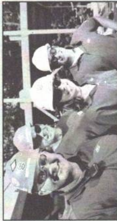
Employee Owners at PC Construction Co.