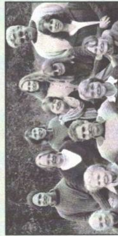
Member Owners of Green Mountain Spinnery

Vermont Employee Ownership Center P.O. Box 546 Burlington, Vermont 05402