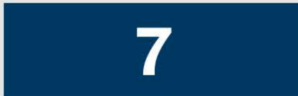
Businesses Operating at Do North Coworking