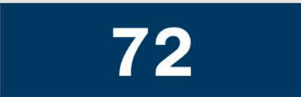
Hours of Entrepreneurship Training & Support