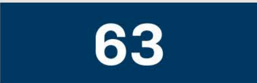
Local Entrepreneurs Served