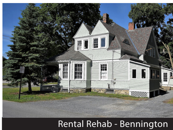
Rental Rehab - Bennington