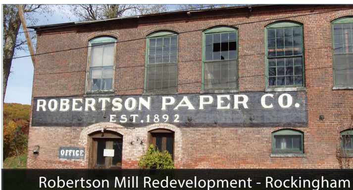
Robertson Mill Redevelopment - Rockingham