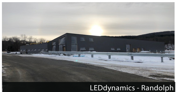
LEDdynamics - Randolph