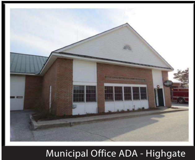
Municipal Office ADA - Highgate