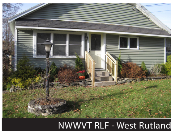
NWWVT RLF - West Rutland