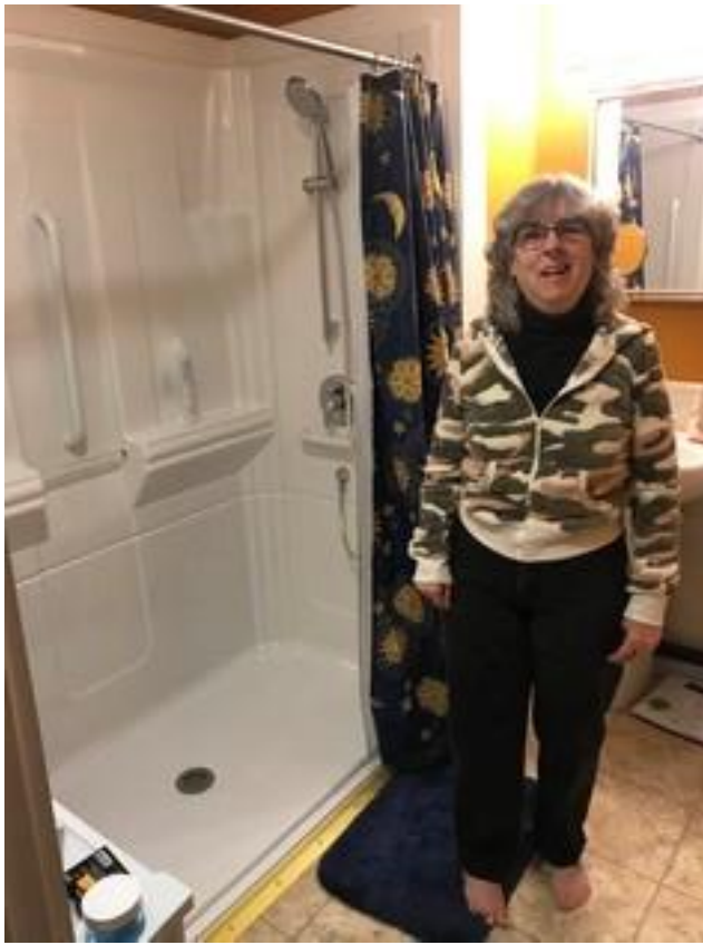
Derby, Orleans County