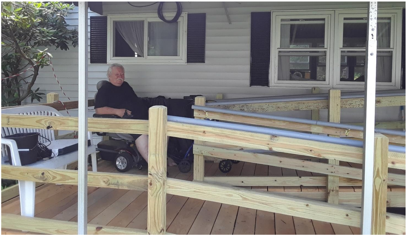
Ascutney, Windsor County, built by COVER Home Repair volunteers