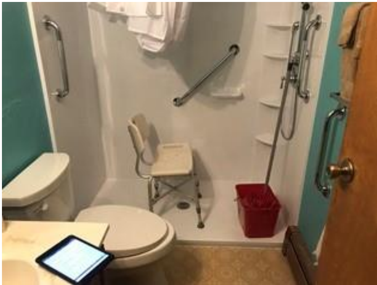
West Wardsboro, Windham County