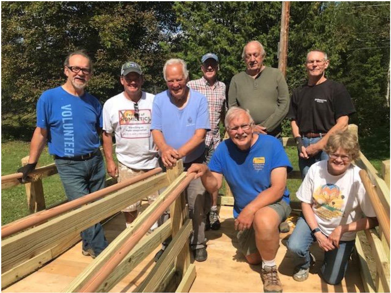
Volunteers who built Eleanor's ramp from COVER Home Repair.