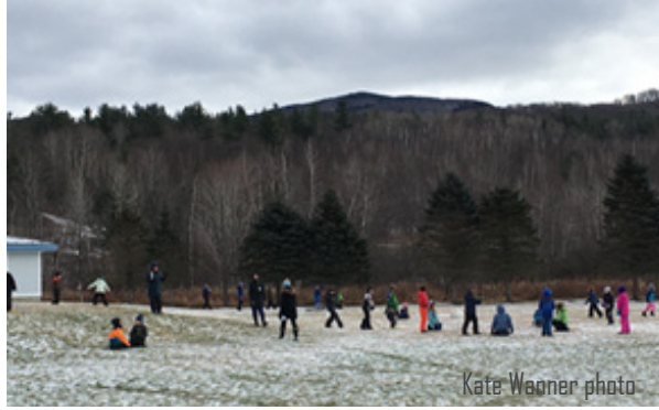
Kate Wagner photo