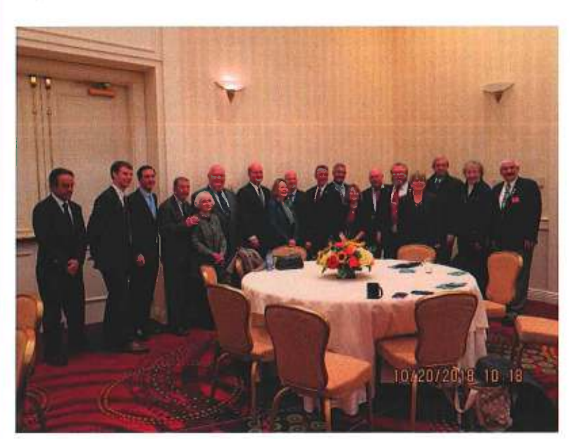
Members of the Commissioning Committee with Dignitaries at the Christening of the VERMONT (SSN 792).