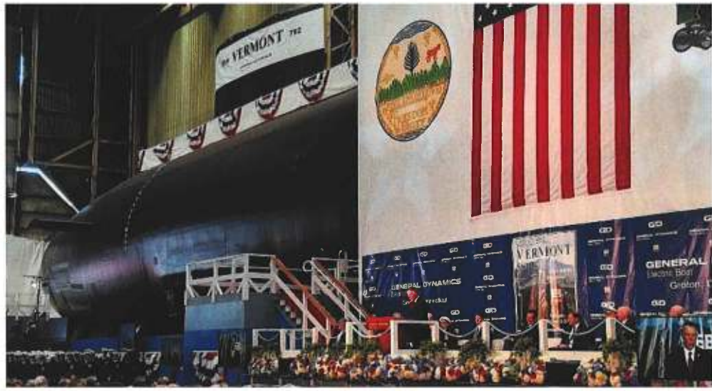
VERMONT (SSN 792)

VERMONT (SSN 792) is under construction at General Dynamics Electric Boat in Groton, CT