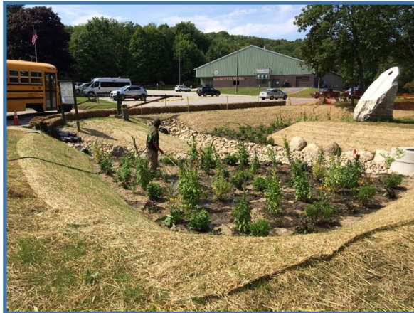
A bioretention basin infiltrating stormwater installed at Georgetti Park in Rutland City, a project identified in the East Creek Watershed Stormwater Master Plan, coordinated by Rutland NRCD and funded by the Ecosystem Restoration Program

Stormwater & Natural Resource Practices Installed