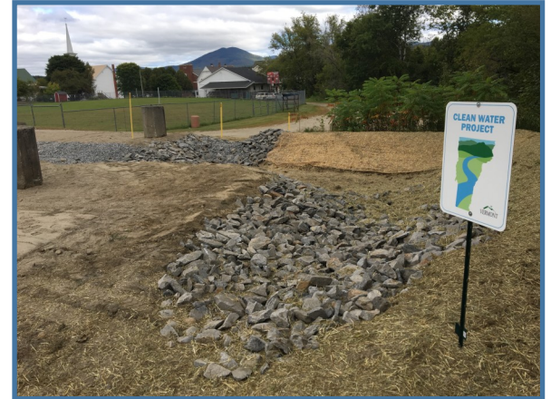
Installation of grassed swales and sediment basins at the Fenton Chester Ice Arena in Lyndon, treating stormwater from a 1.4 acre gravel parking lot to reduce runoff to the stream, coordinated by Caledonia County NRCD and funded by the VT DEC Block grant