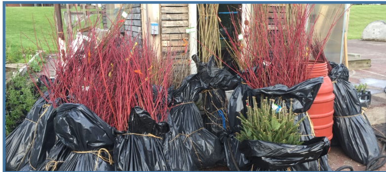
Trees & shrubs queued up for a stream buffer planting in Pawlet, VT