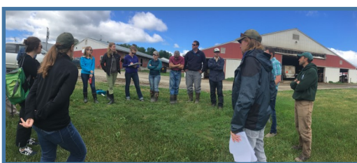
RAP Calibration Field Day for Partners coordinated by the Orleans County NRC D