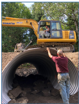
Conservation Districts support healthy aquatic habitats in a number of ways. Essex County NRCD coordinated a culvert replacement on a tributary to the Connecticut River to restore Aquatic Organism Passage, with funding support from U.S Fish & Wildlife.