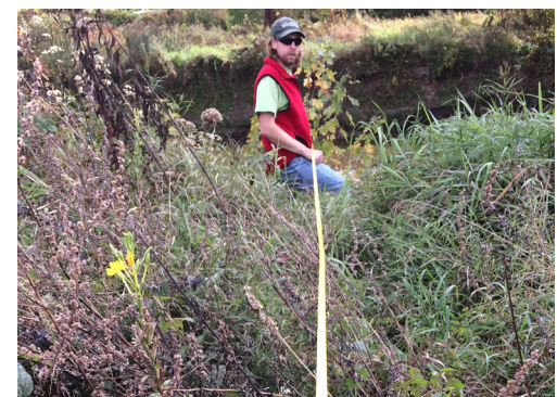
VAAFAM water quality farm specialist measures the distance of an annual crop field perennial buffer during an inspection.

PROPOSED PENALTIES FOR VIOLATIONS ASSOCIATED WITH 30 NOTICES