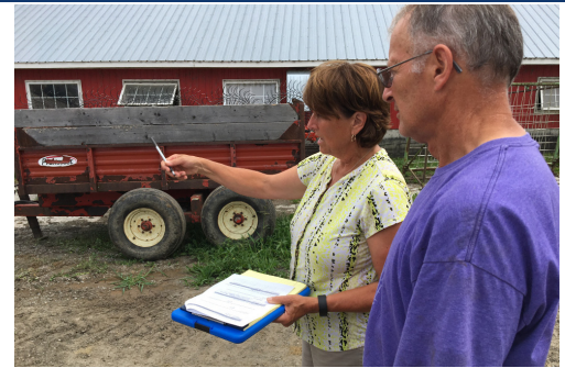
VAAFAM water quality farm specialist discusses farm practices with a farmer during an inspection.

In fiscal year 2018, the Regulatory Program in the Water Quality Division at the Vermont Agency of Agriculture, Food & Markets made 652 water quality compliance visits and issued 118 enforcement actions for alleged violations.