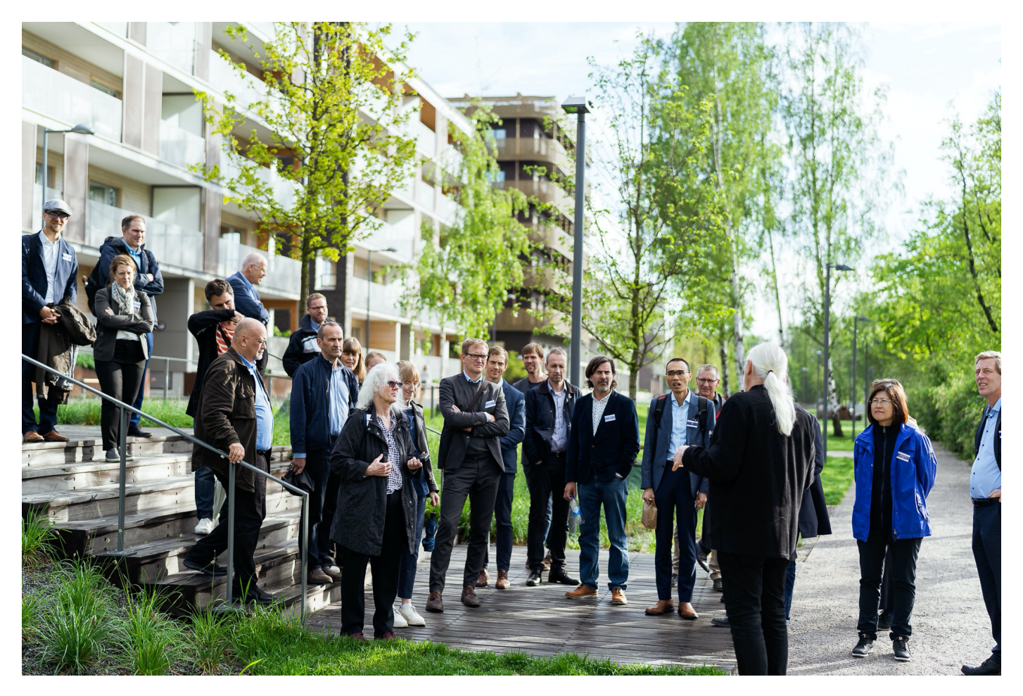
City leaders from around the world learned how Stockholm is using biochar for myriad uses, such as urban forestry and stormwater management.