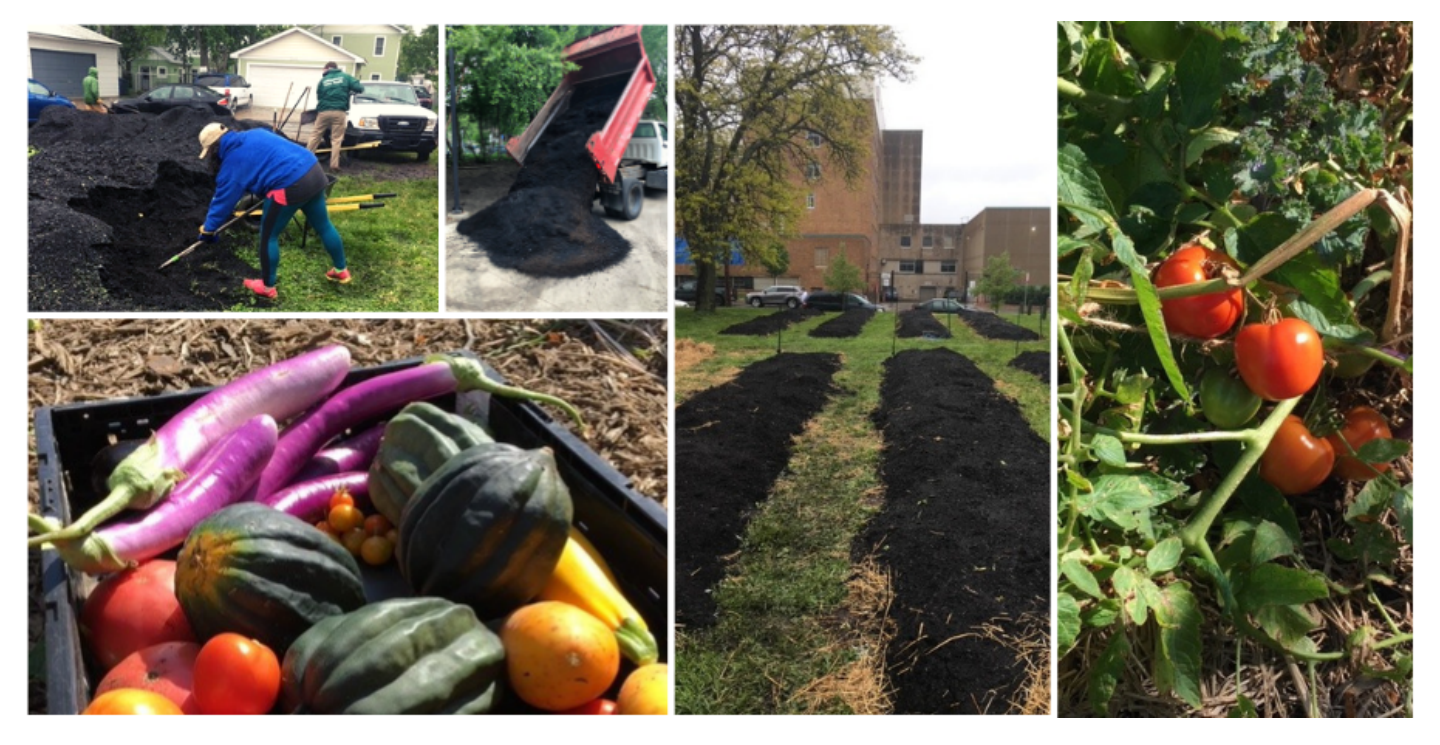
Minneapolis is already using biochar to bolster urban agriculture. After three city leaders visited Stockholm in May, Minneapolis is considering new uses for the carbon-capturing soil additive.

Biochar is nothing new in Minneapolis. The city has, for years, bought truckloads of the charcoal-like material from a plant in Missouri and used the dusty black nuggets for a well-known use: to enrich soil for urban agriculture and bolster the local bounty of fruits and vegetables to harvest.