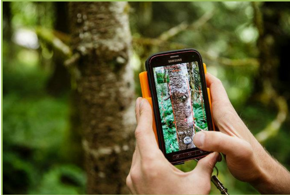
Innovative smartphone technology

Helping small forest owners to access the benefits of the carbon market & get paid for their conservation efforts