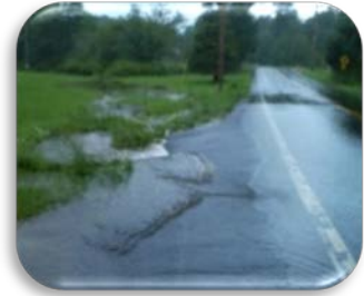
Photo: Stormwater runoff from impervious surfaces