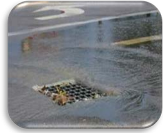
Photo: Road stormwater collection