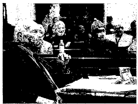
UPDATED: Senate unanimously approves 'extreme risk' gun bill