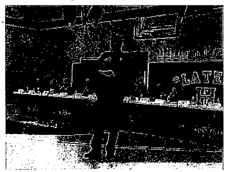
Fair Haven police chief: 'I think we dodged a bullet'