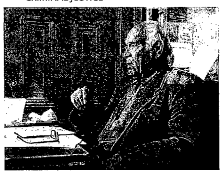
Advocates for Bennington drug court meet with lawmakers