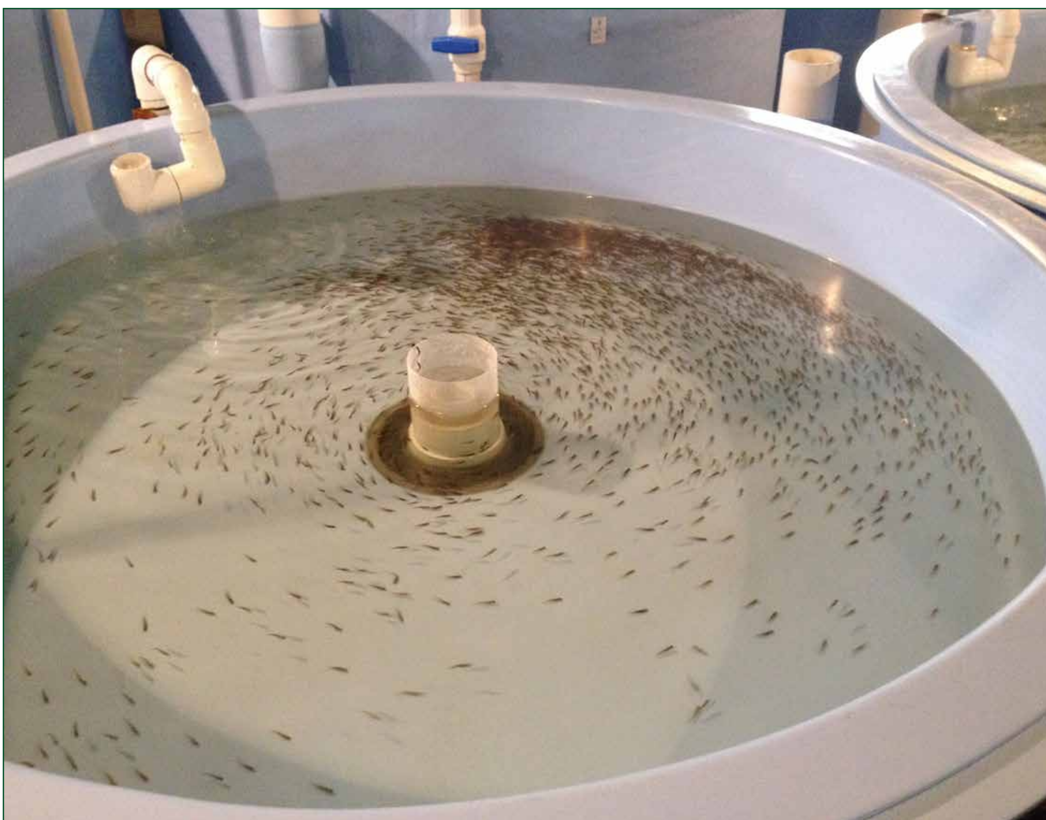
Young landlocked Atlantic salmon at Ed Weed hatchery are raised in a new tank system that recirculates water, saving water use and the propane needed to heat it.