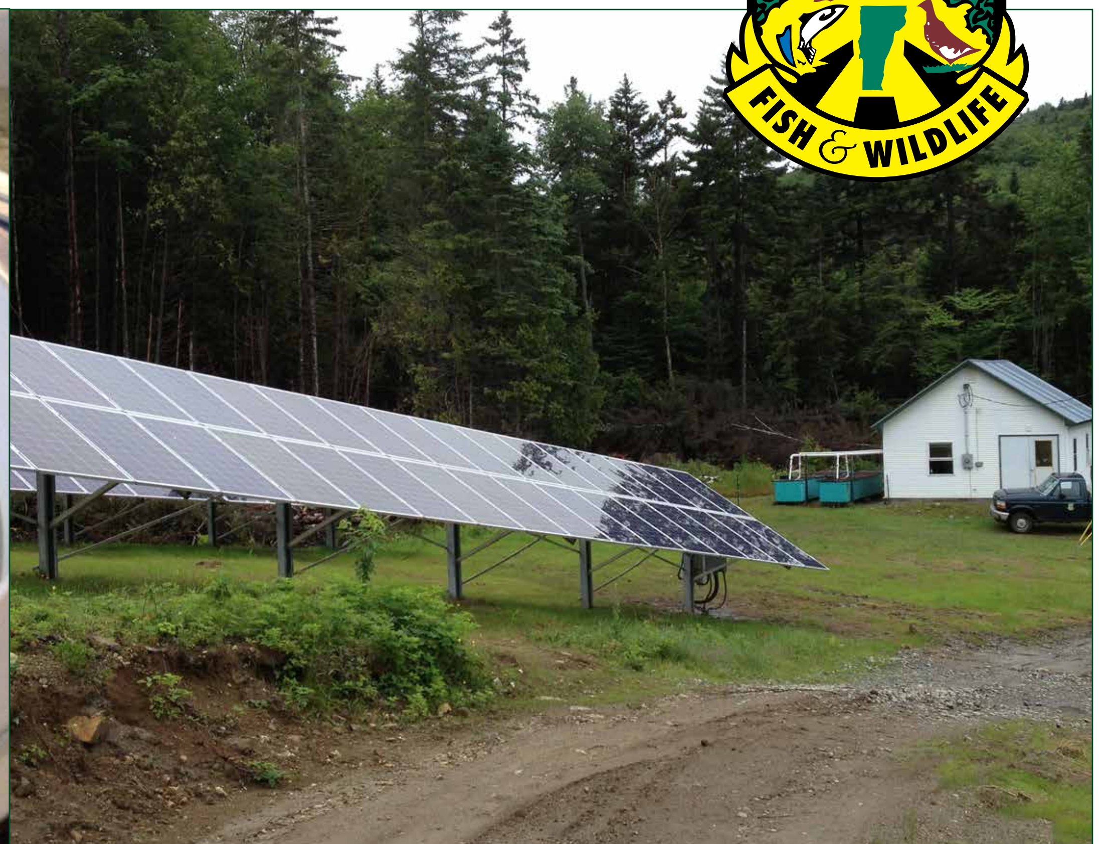
A solar panel array installed at the Bald Hill hatchery is producing approximately 34,000 kWh annually and will generate $160,000 over the 25 year expected lifetime of the panels.