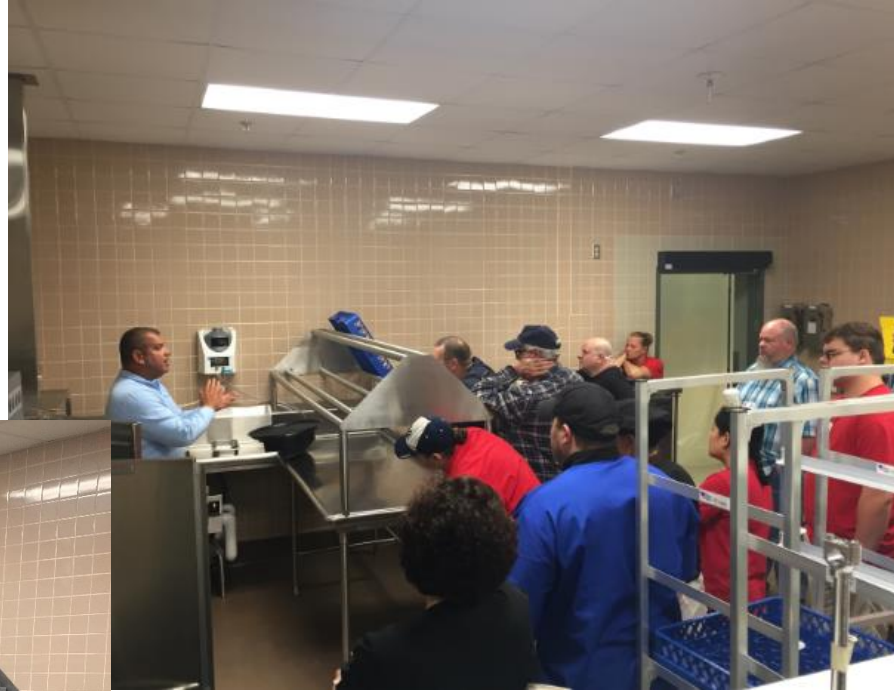
Vendor training on new Dish Washer