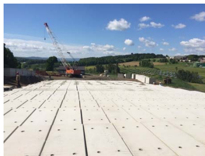
In-Ground Crypt Field