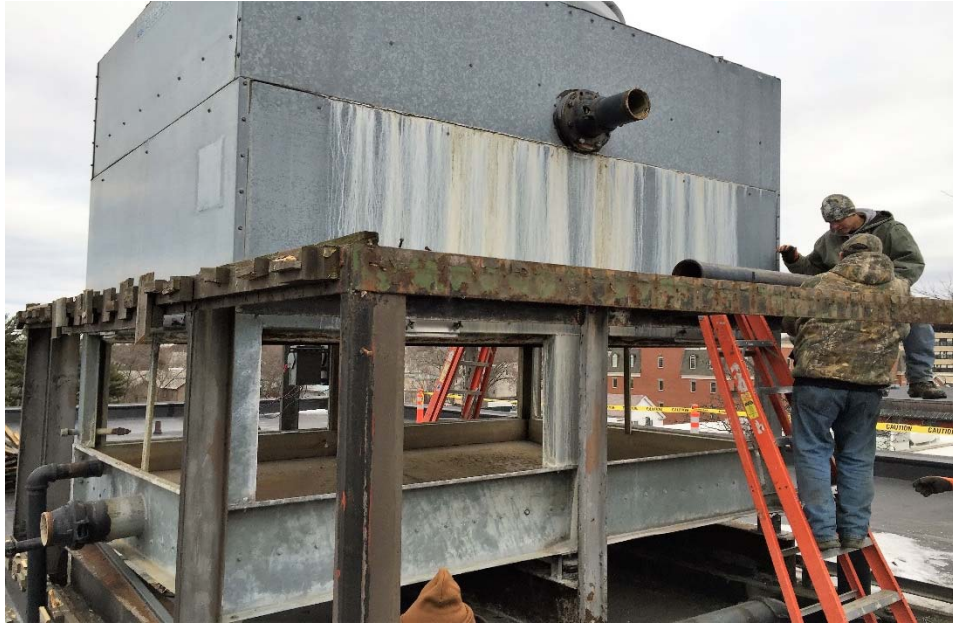
Old Cooling Tower

In winter of 2016, the cooling tower and steel base structure at the Costello Court was replaced. As part of the same larger overall project, 90 VAV boxes were replaced inside (not shown) in the spring of 2016. The new equipment will perform better with higher efficiencies. Total cost of this phase of the multi-year HVAC project was $352,387.