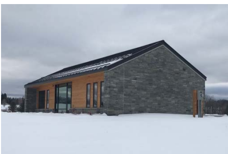
Public Information Building

The Office of Veterans Affairs anticipates opening these sections in the summer of 2017 and hopes to conduct year-round burials from that point forward.