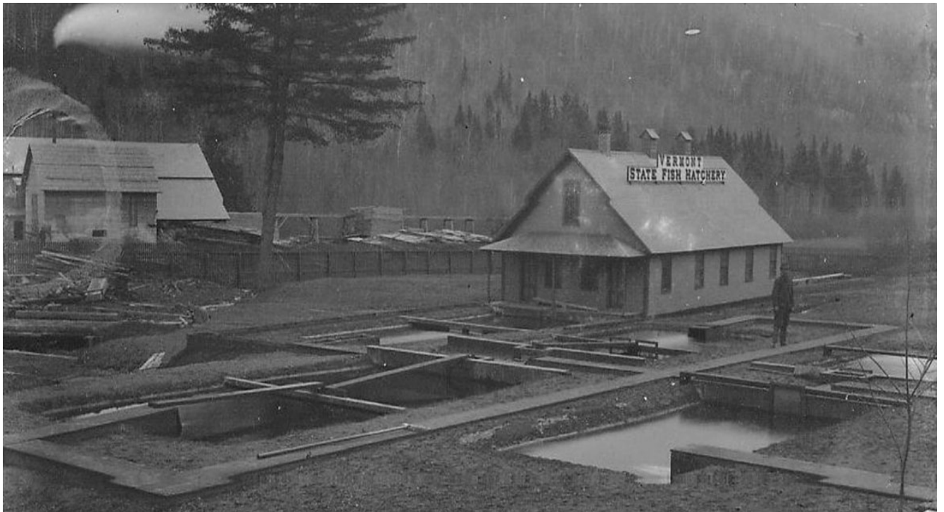
Historic Photo of the Fish Hatchery in Roxbury.

A partial capital investment was made regarding the Roxbury Hatchery rebuild with capital bill language that allows VTFWD to contract for the full rebuild amount. We are currently proceeding through the Construction Documents phase, as well as permitting for the facility. We did experience some issues during the permitting pertaining to wetlands issues with the Federal Army Corps of Engineers, but these have been resolved and we expect permission to proceed. We hope to proceed with the start of construction later this year with an anticipated completion date in late 2018.