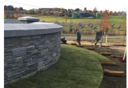
Entry Walls & Site Work