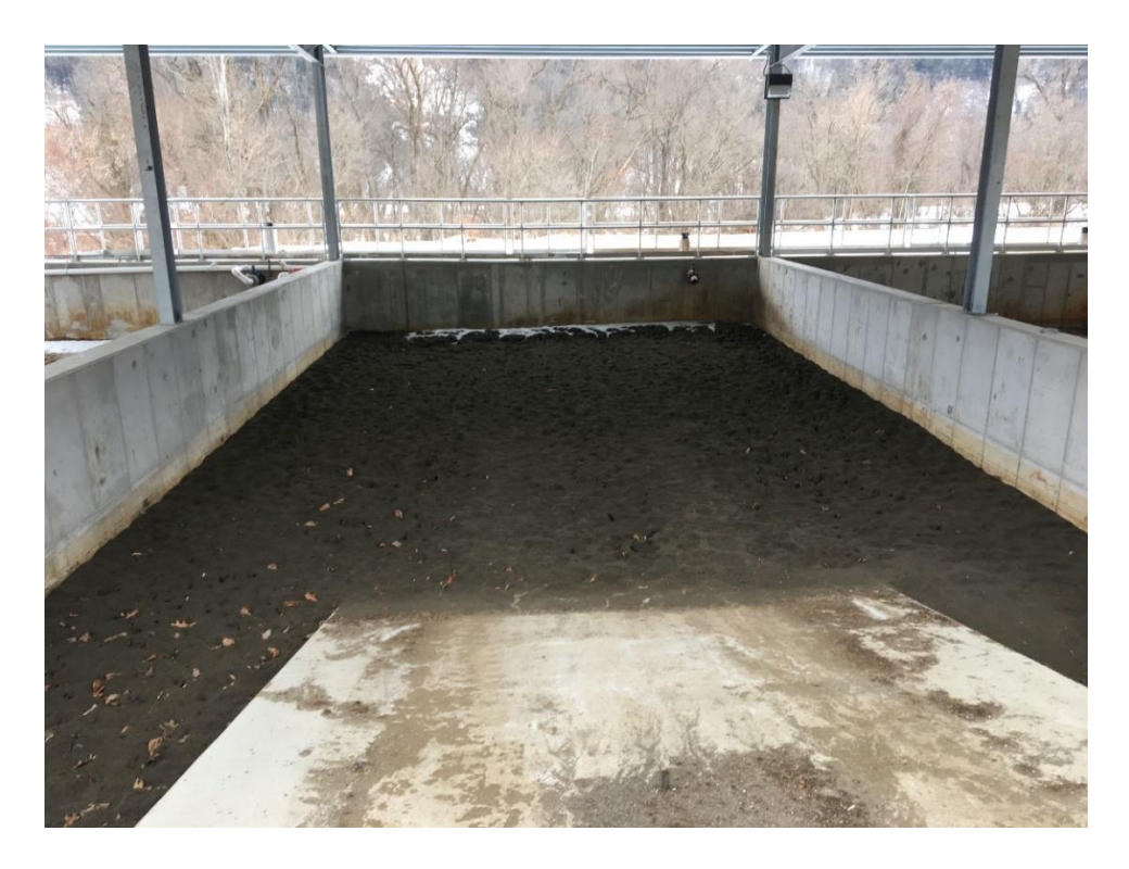
Figure 6: Close-up of individual sludge drying bed (containing phosphorus-bearing chemical sludge).