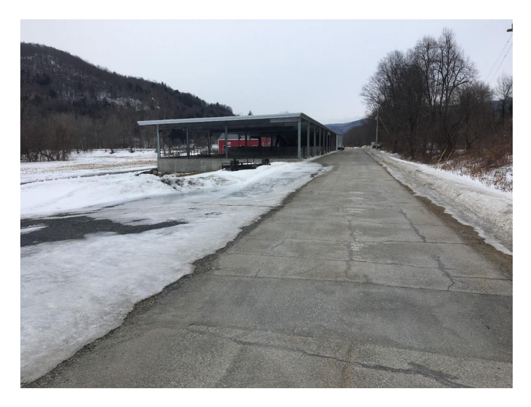
Figure 4: New covered sludge drying bed structure (with new process building in background).