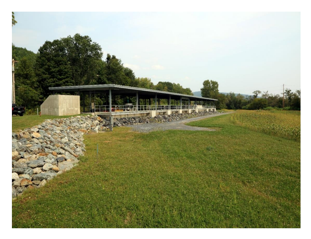
Figure 5: Rear of the new sludge drying bed structure as viewed from the new process building.