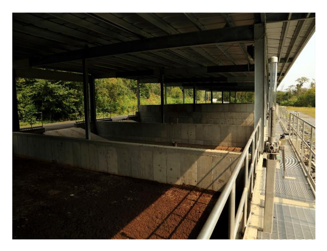
Figure 7: Sludge drying beds viewed from the rear of the new structure.