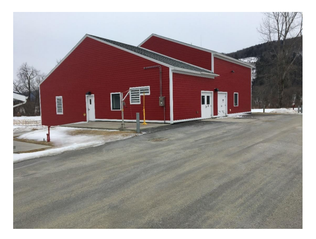
Figure 2: New process building housing CoMag<sup>®</sup> system for improved phosphorus removal.