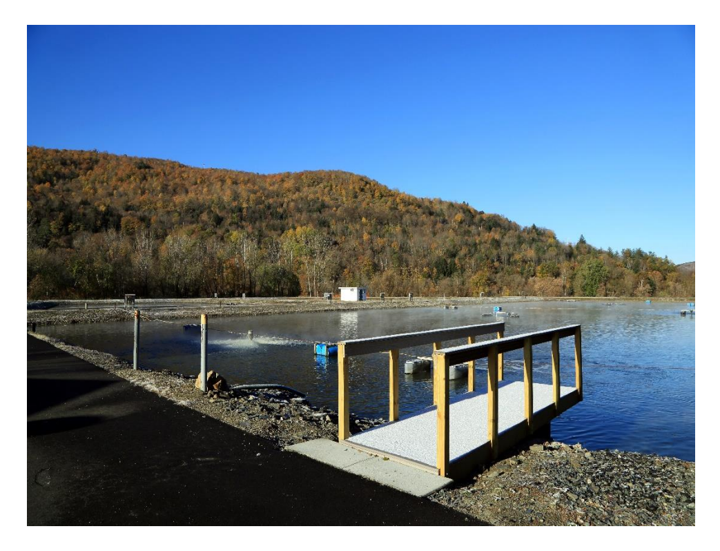
Figure 1: Existing aerated lagoon system.