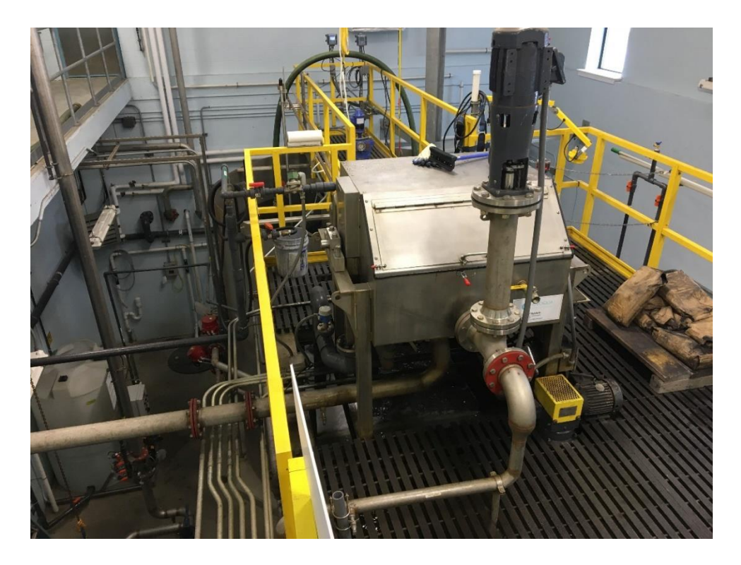
Figure 9: Magnetic drum separator (removes magnetite from CoMag® treated wastewater).