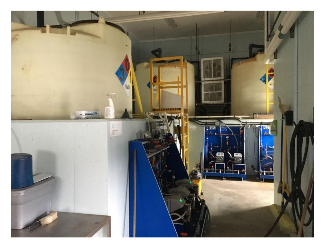
Figure 10: Chemical (PAC, FeCl<sub>3</sub> & NaOH) storage tanks utilized during TP removal process.