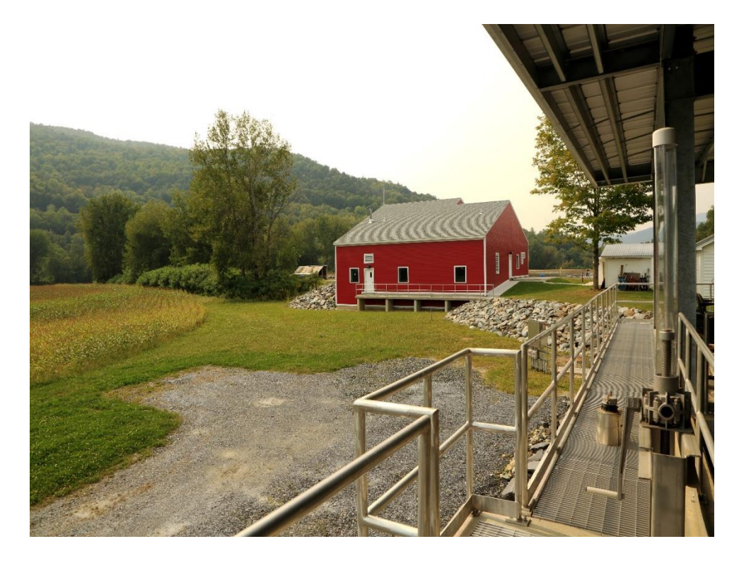
Figure 3: New process building as viewed from the rear of the new sludge drying bed structure.