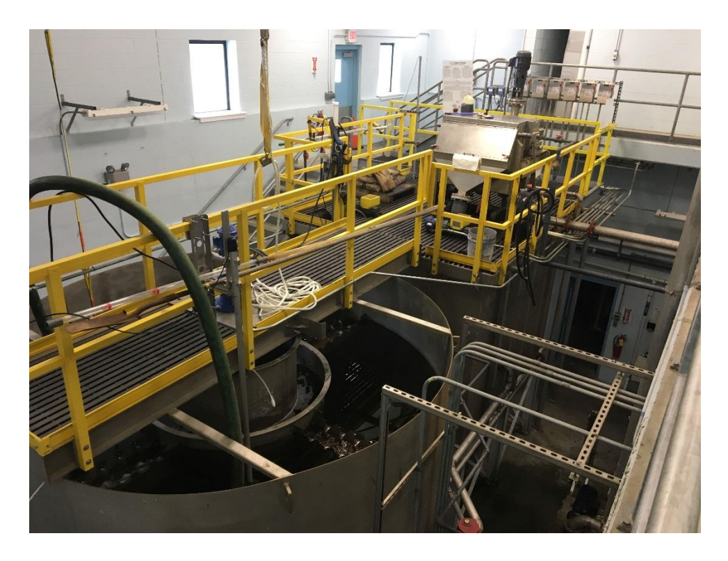
Figure 8: New CoMag® process element (bottom left) located within process building.