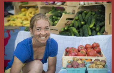
Mighty Food Farm

VHCB has funded more than 125 local developments serving Vermonters with special needs, providing housing and saving the state millions of dollars that would otherwise be spent on more expensive institutional care.