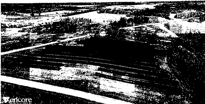
1 MW