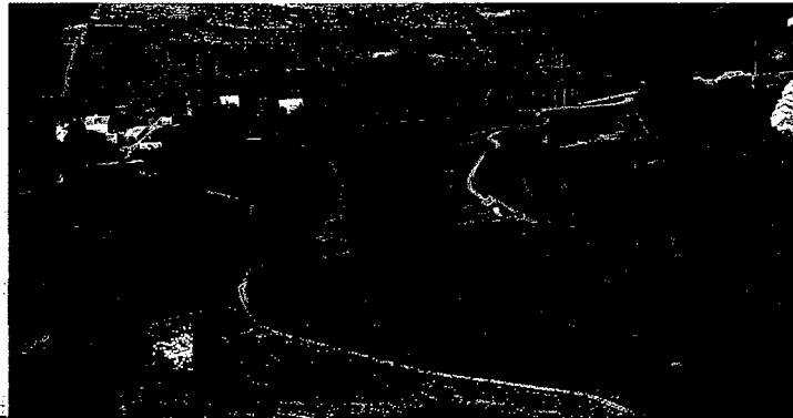
2.2 MW