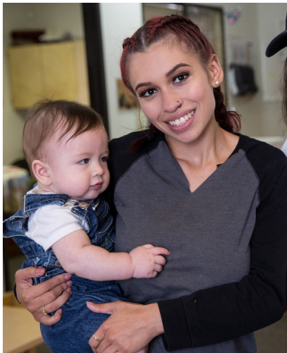
Photo: A Head Start parent from Oakland, California with her child.

"My oldest son started EHS at 7 months old. I knew it was going to help him develop and learn; I didn't know that it was going to be great for me too. I was inspired to obtain my high school diploma and I graduated when my oldest son was just over a year old. I then enrolled in community college and started working to get my associates degree in early childhood education."