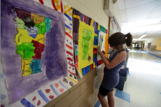
Artists in Schools program, Academy School, Brattleboro