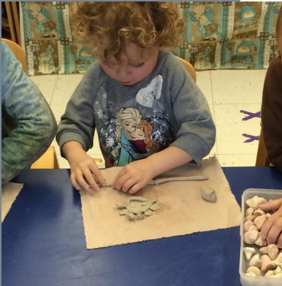
Head Start Arts program, Brattleboro Museum and Arts Center, Brattleboro

76% of households engage in the arts on a regular basis.