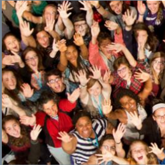
Governor's Institute, Castleton State College