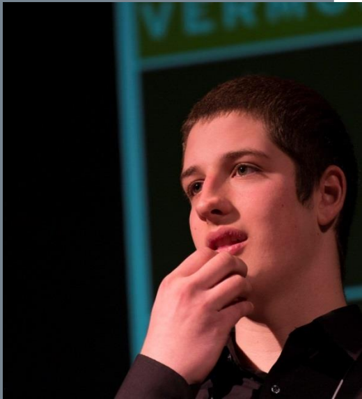
Poetry Out Loud finals, Barre Opera House