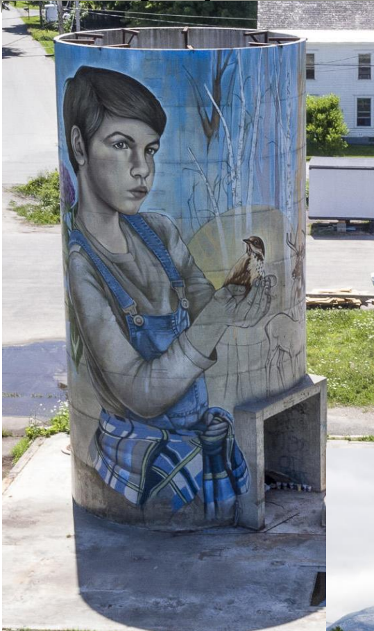
Silos Project, Cambridge, Animating Infrastructure