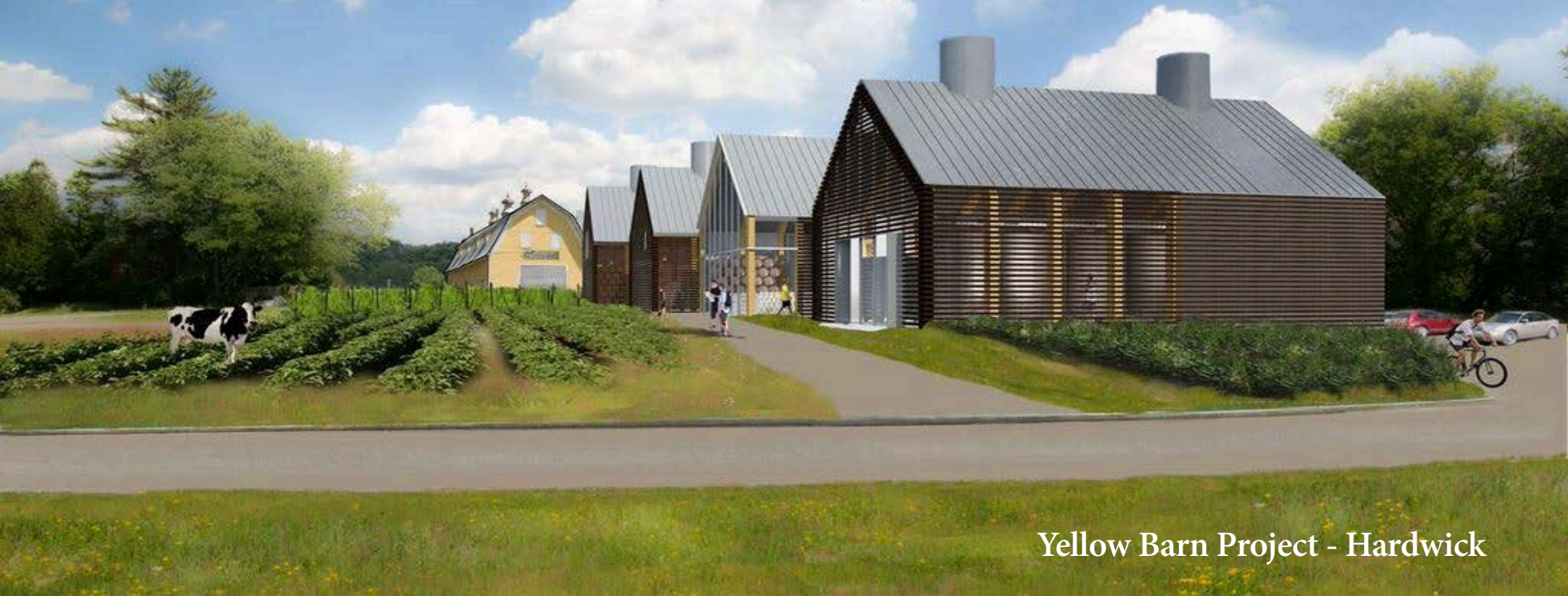
Yellow Barn Project - Hardwick

Thus far, REDI has helped seven small towns or businesses apply for $1 million in federal or philanthropic funding. $350,000 is secured and more funding decisions are pending.