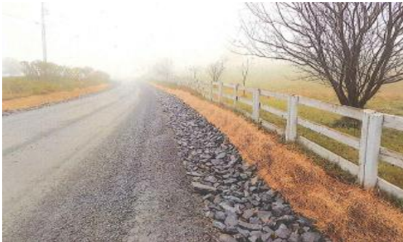
Ditching, St. Johnsbury