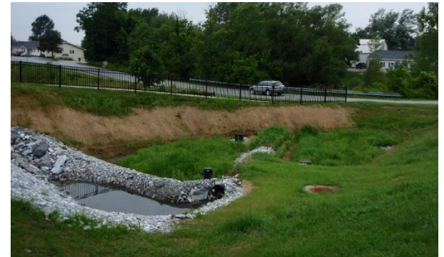
Gravel Wetland, St. Albans