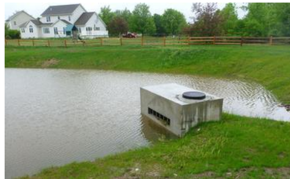
Retention Pond, South Burlington