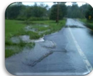
Photo: Stormwater runoff from impervious surfaces