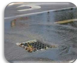
Photo: Road stormwater collection