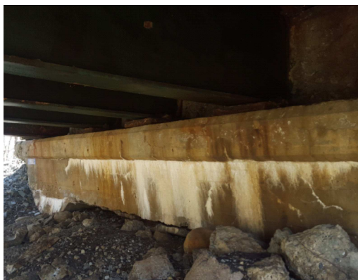
Poor Condition of Abutment #1