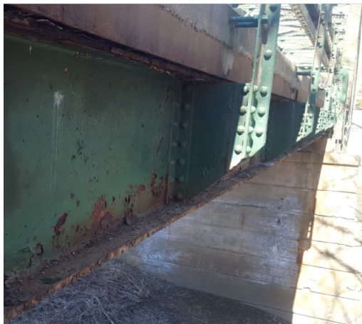
Deterioration of the Approach Span Beams