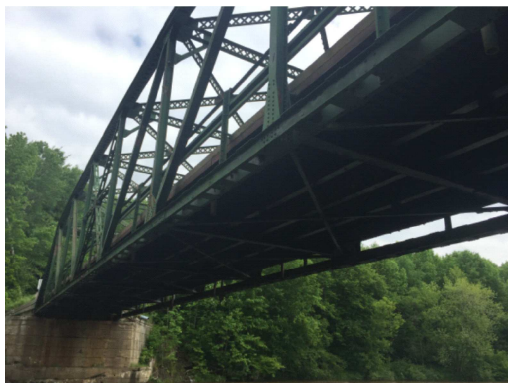
Existing Bridge Elevation View

Bridge Construction is anticipated to begin in April 2018. During construction the bridge will be closed to traffic and detoured around the project.