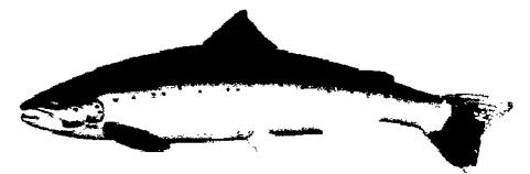
Atlantic Salmon (17 - 21 in)