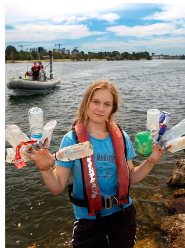
A Greenpeace volunteer collects single-use plastic bottles from Sydney's Botany Bay

For example, through the Coca-Cola Foundation, the company has contributed sizeable investments in community recycling and anti-litter schemes, which keep the focus firmly on customer responsibility rather than the billions of throwaway plastic bottles being put on the market by the company each year. These go back to Coca-Cola's role as a founding member of Keep America Beautiful in the 1950s, an organisation that has been criticised for opposing government initiatives to reduce plastic pollution, including DRS, and diverting attention away from the role businesses could play in reducing single-use packaging. 45 Coca-Cola's continuing donations to Keep America Beautiful, including a community grant scheme for recycling bins, form part of its headline 2020 sustainability goal to recover and recycle the equivalent of 75% of the bottles and cans it sells in developed countries by 2020, of which the company numbers 36 countries. 46 However, analysis of Coca-Cola's sustainability reports show regression between 2013 and 2015, with the reported rate dropping from 63% to 59%. 47