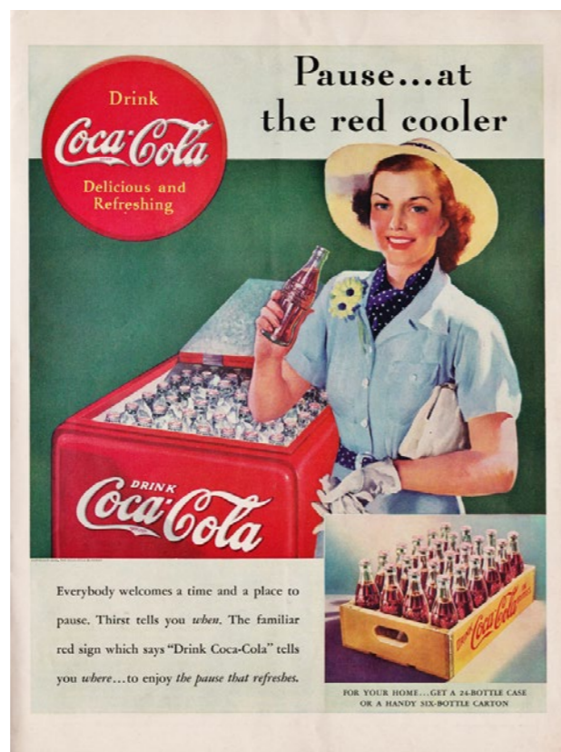
A Coca-Cola ad from the 1940s showing retail and domestic reusable bottles

Absurdly, Coca-Cola invented bottle deposit systems in the early 1900s. Its glass bottles were too valuable to be single-use so the company introduced a refundable charge covering 80% of Coca-Cola's bottlers. This scheme led to 96% of bottles being returned and reused in the late 1940s.