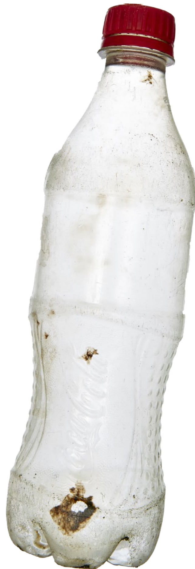
Coca-Cola bottle collected from the Thames Estuary, UK.

Coca-Cola also needs to develop new vending technologies for domestic and on-the-go use. The company previously recognised that home delivery systems were a 'long term opportunity', but its 2015 home soda fountain was scrapped after just one year. 14