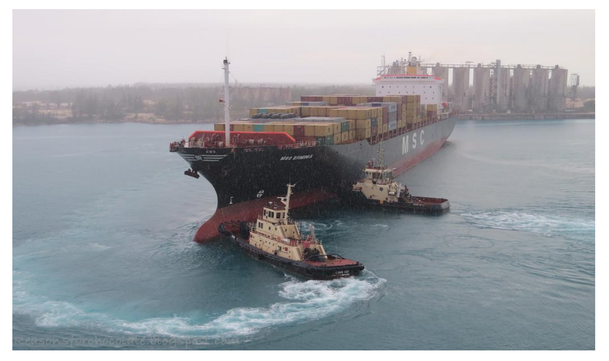
Working together. Each play an important and necessary role.